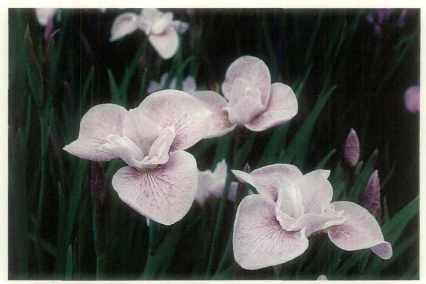
Mesa Pearl (Bauer/Coble '93) AM Winner for 2000