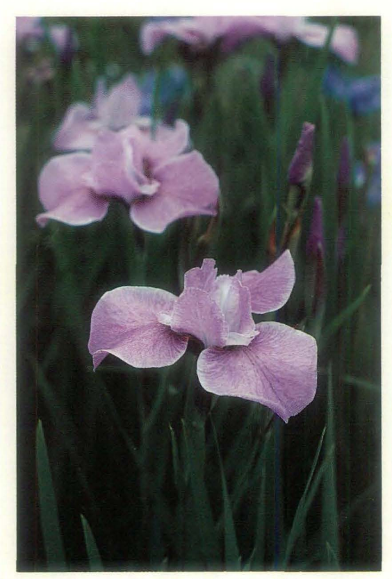
Sprinkles (Bauer/Coble '93) AM Winner for 2000