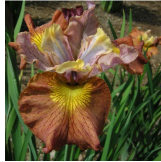
S19-32-11 (S15-54B-11 X Cape Cod Girls)