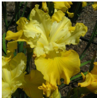
S19-48-10 (S15-83-13 X S17-26- 1)