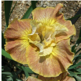
S19-40-21 S15-80A-13 X S16- 8-11