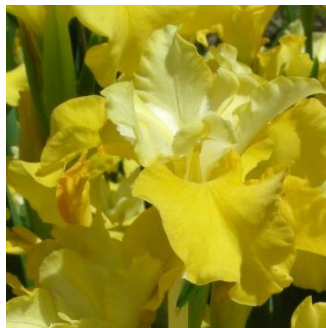
S19-15-13 (Rounding Third X S15-83-12)