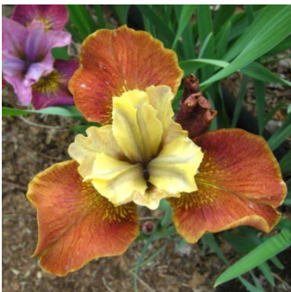
S19-18-12 (S15- 3- 1 X S15-30A-11)