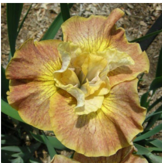
S19-40-21 (S15-80A-13 X S16- 8-11)