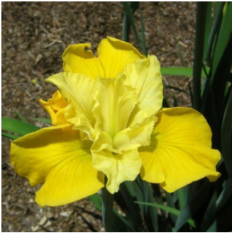
S17-23-11 (S14-38-14B X S13- 4-11)