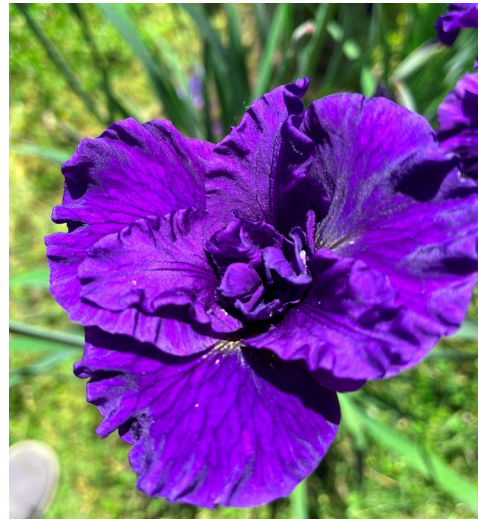
23T9B3 (Packet 3)