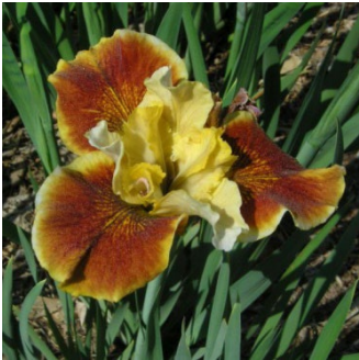
S19-52-10 (S16- 7-11 X S15-30A-11)