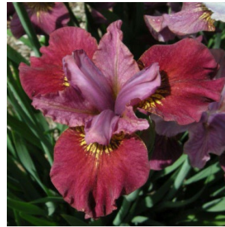
S19-17-15 (S15- 2-10 X Will You Wear Red)