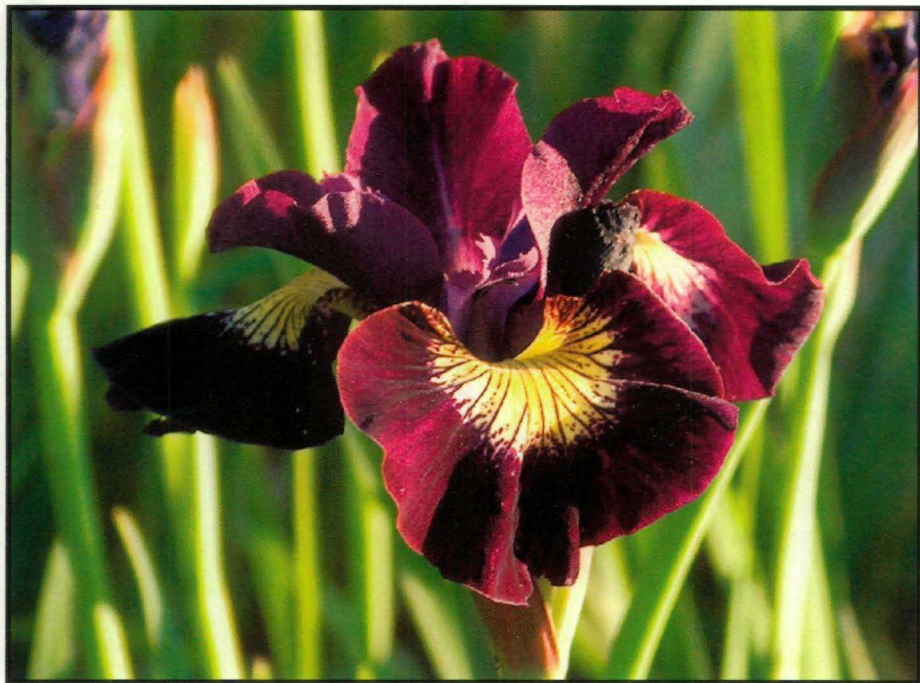
SULTAN'S RUBY (Hollingworth '88)

Breeders Since 1993 - Originators - Display Gardens