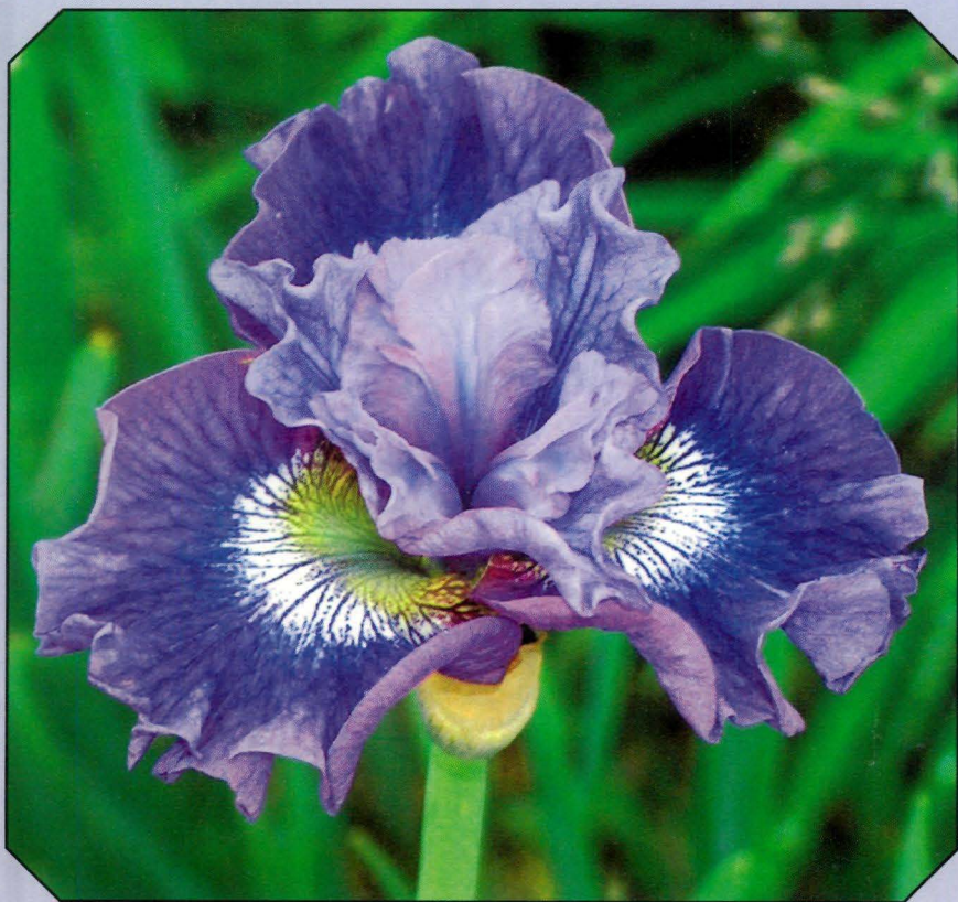
BLUEBERRY FAIR (Hollingsworth '97)