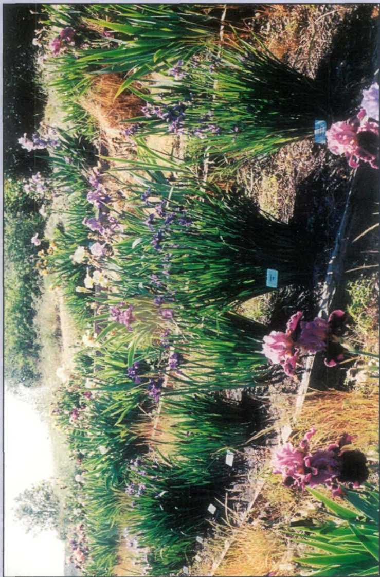
IRIS BLOOM IN CALIFORNIA'S CENTRAL VALLEY